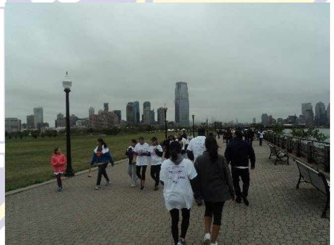
(Scene from the Walk)